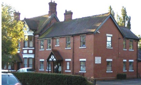
Mansfield Medical Centre